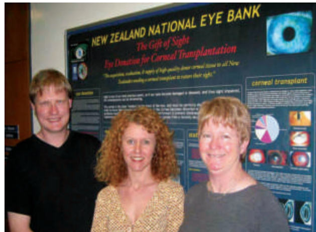
NZ National Eye Bank Staff.